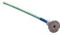
Earthbridge DB, One Stud, Insulated Cable, Straight