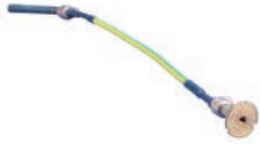
Earthbridge DB, One Stud, Cable to Solid Round Steel