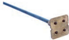
Earthbridge B161, Four Stud, Solid Round Steel, Straight